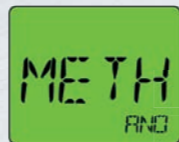
Methanometer 1 scale : % CH 4