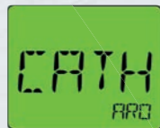
Explosimeter-catharometer 2 scales : % LEL & % Vol. gas