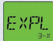
Explosimeter 3 scales : PPM, % LEL, % Vol. gas